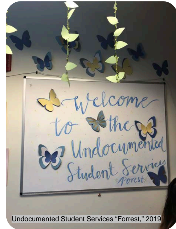
Undocumented Student Services "Forrest," 2019